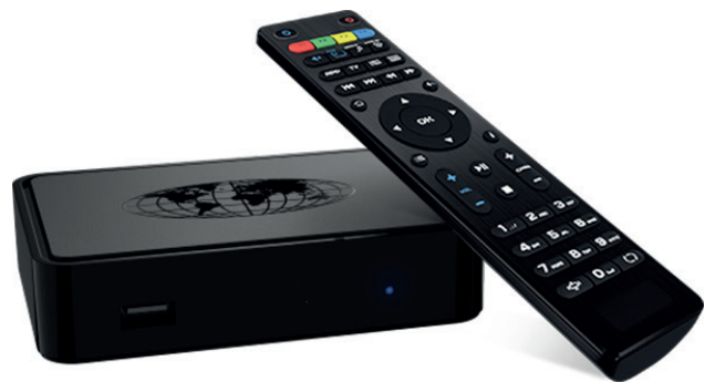
Set-Top-Box with remote control

Width/depth/height: ..... 127/87/30 mm Weight: ..... 190 g